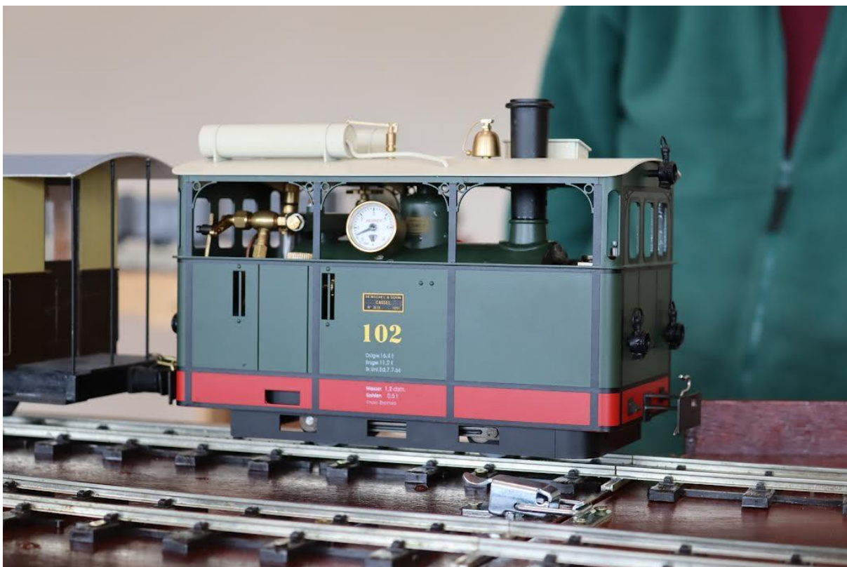
4 A Regner steam tram, available as a kit or RTR. See this link: https://www.regner-dampftechnik.com/product-page/kastenlok-nr-102-easy-line-fertigmodell